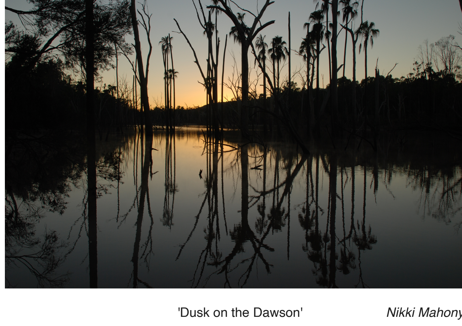
'Dusk on the Dawson'